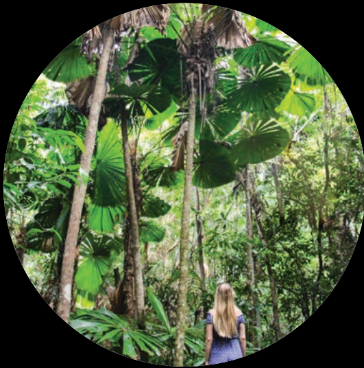
Guided rainforest walk Join a guided walk along a rainforest boardwalk with great photo opportunities