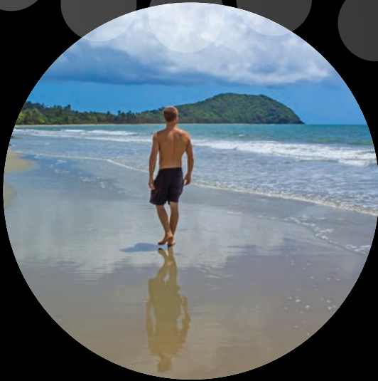
Walk Cape Tribulation Beach Stroll along the beach with spectacular views of this iconic World Heritage Listed site