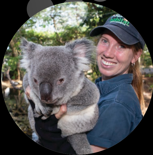
Immersive wildlife tour Explore Australia’s leading wildlife experience and get up close to the region’s iconic wildlife