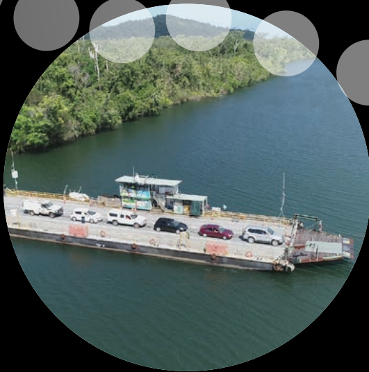
Daintree ferry Cross the Daintree River on a cable-driven ferry