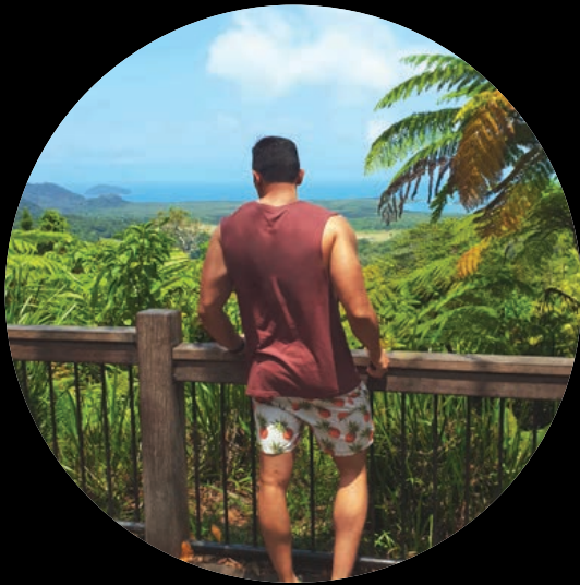
Walu – Wugirriga Stop at Alexandra Lookout for magnificent views of the Daintree River and Coral Sea