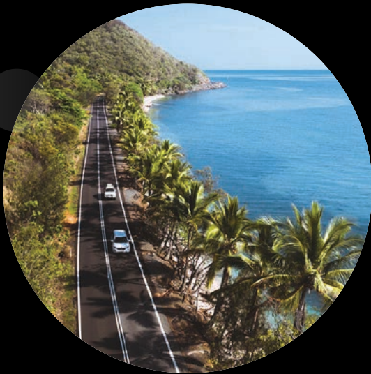
Great Barrier Reef Drive Journey north on one of Australia’s most scenic coastal drives