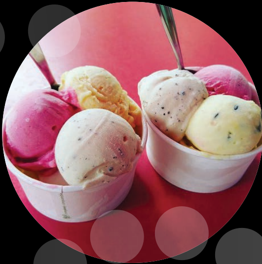
Daintree Ice Cream Company Enjoy delicious locally made ice cream in the rainforest