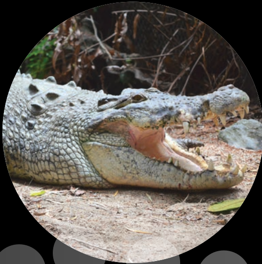
Crocodile cruise Spot crocodiles and other wildlife on the famous Daintree River