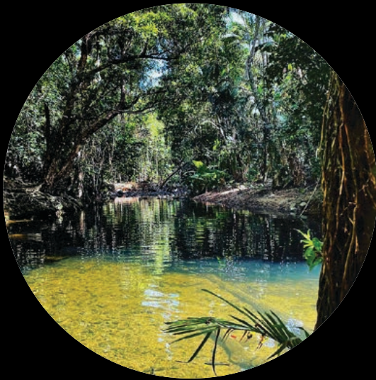
Daintree swimming hole Enjoy a refreshing dip in a pristine rainforest stream